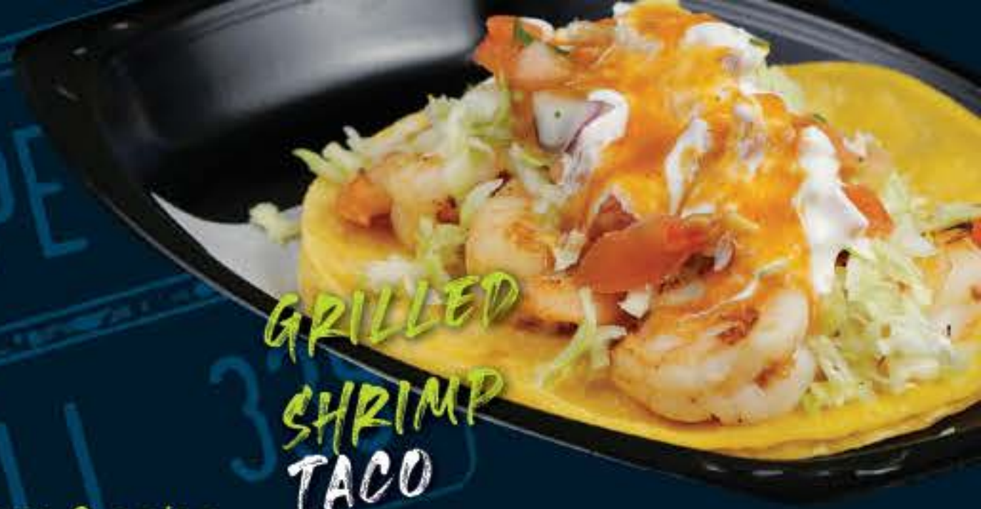
GRILLED SHRIMP TACO