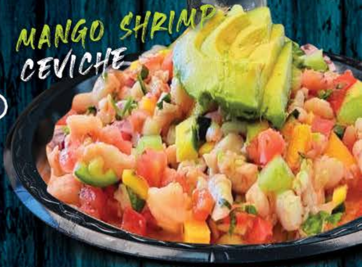
MANGO SHRIMP CEVICHE